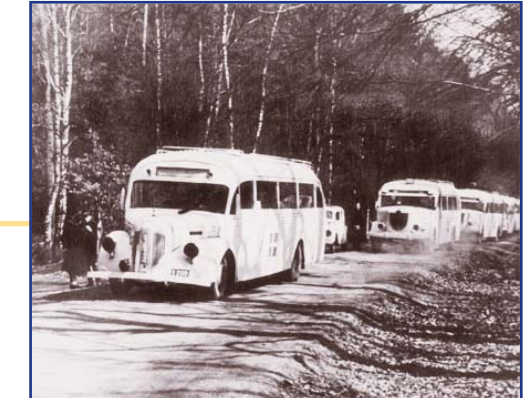
Swedish Red Cross buses in Germany during WW2.

Despite continuous efforts by Hitler's Nazi regime to win King Boris III as an ally, the Bulgarian people and the Orthodox Church managed to save almost 50,000 Jews.