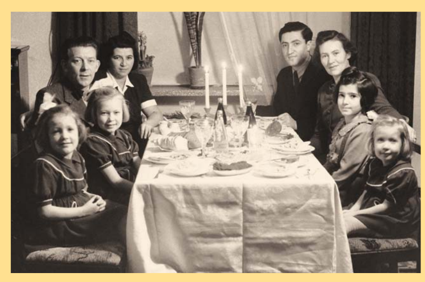
A Jewish family from Denmark, who was ferried to safety in Sweden, has Christmas dinner at the home of a Swedish family in Landskrona.

Thanks To Scandinavia An Institute of the AJC